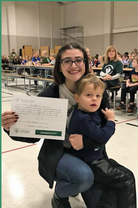
K3 - Everett

The teachers watch during the month to see the students exemplifying the virtue of the month. This month, we'd like to recognize these students who did a good job of being generous. Congratulations students!