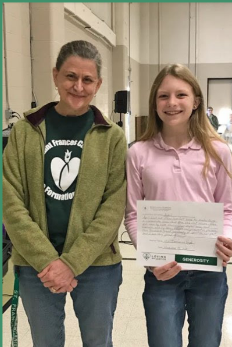
6th Grade - April